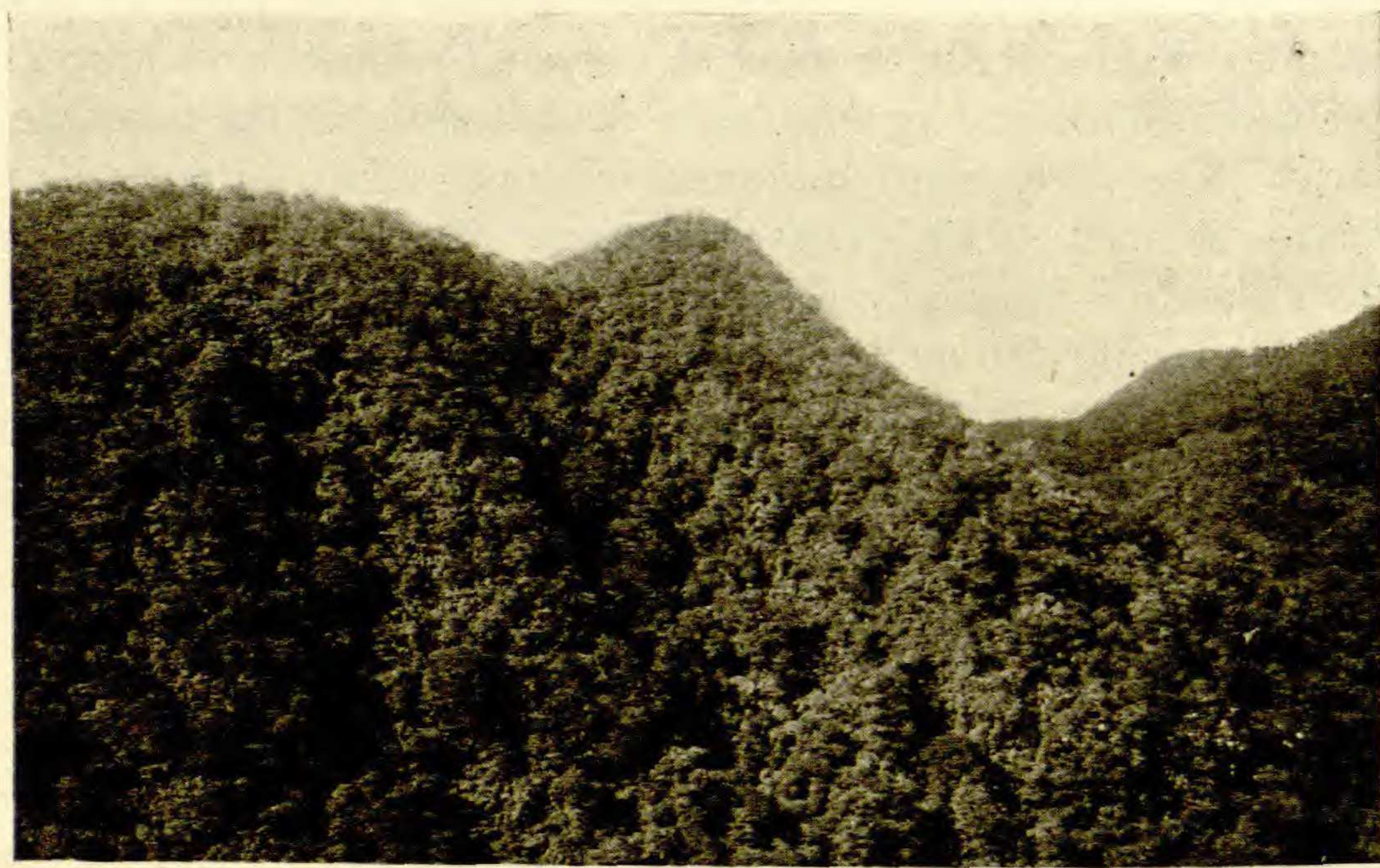
FIG. 1.—Tapestry forest on deeply eroded mountain ridges

The finest examples of tapestry forest occur in the following situations. On the island of Kauai: the Na Pali district, Wainiha,